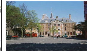
“Gravensteen” Pieterskerkhof 6 2311 SR Leiden