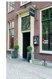
“het Prentenkabinet” Kloksteeg 25 2311 SK Leiden