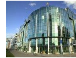
“Golden Tulip Hotel” Schipholweg 3 2316 Leiden